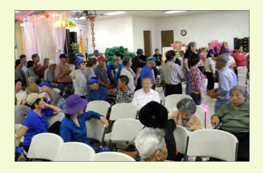
To improve the health of low-income elderly persons at least 60 years of age by supplementing their diets with nutritious USDA Foods, the Commodity Supplemental Food Program (CSFP) collaborates with Houston Food Bank, hosted by Annam Community Center helping more than 300 seniors.

This year, the Center also reprised its monthly Food and Health Fair, which falls on every last Wednesday of the month. For each event, about 40 new families apply to regularly receive goods. Considering the abundance of General Food and Health Fairs attendants, we have scheduled another fair for the middle of the month, focusing our outreach to the the local Hispanic community and serving 1,523 families.