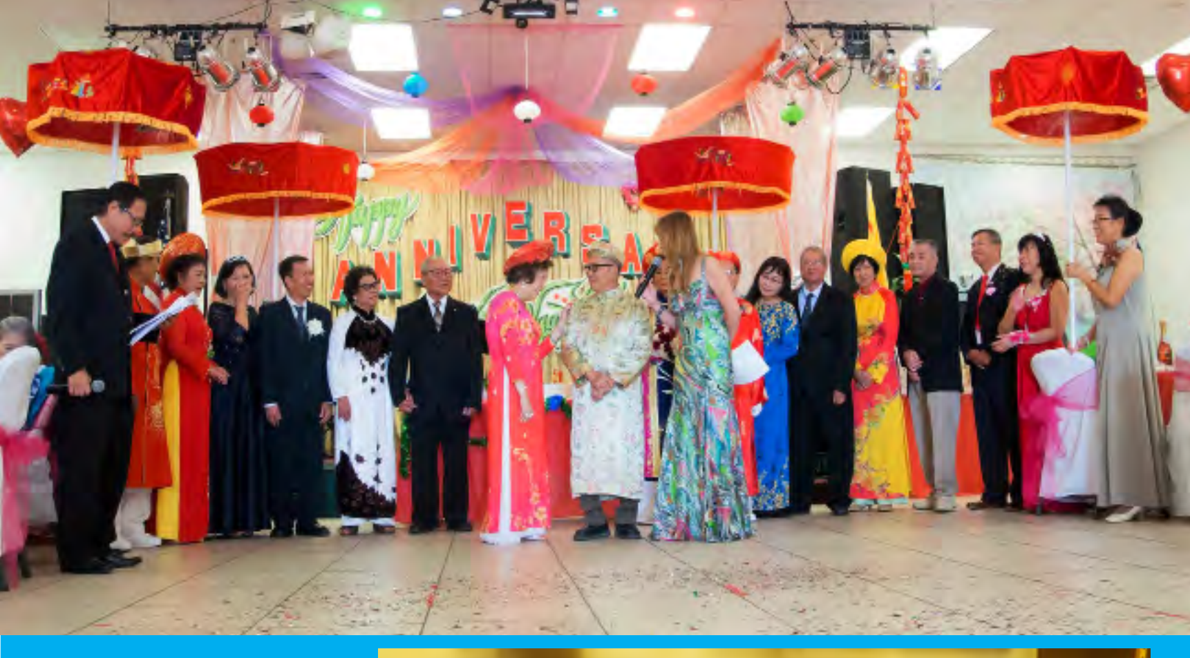
Happy Wedding Anniversary

All members of the Kitchen Team are certified Food Handlers or Food State of Texas