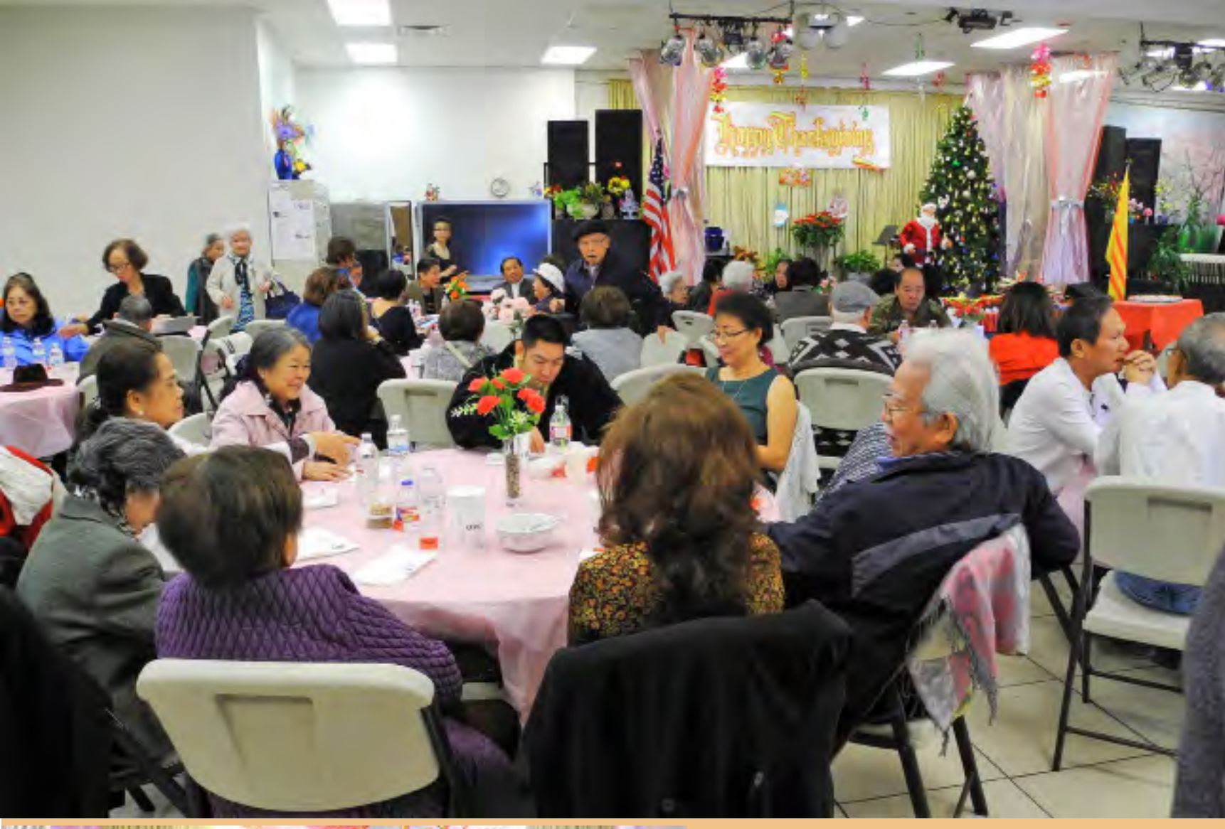
Happy Thanksgiving 2018