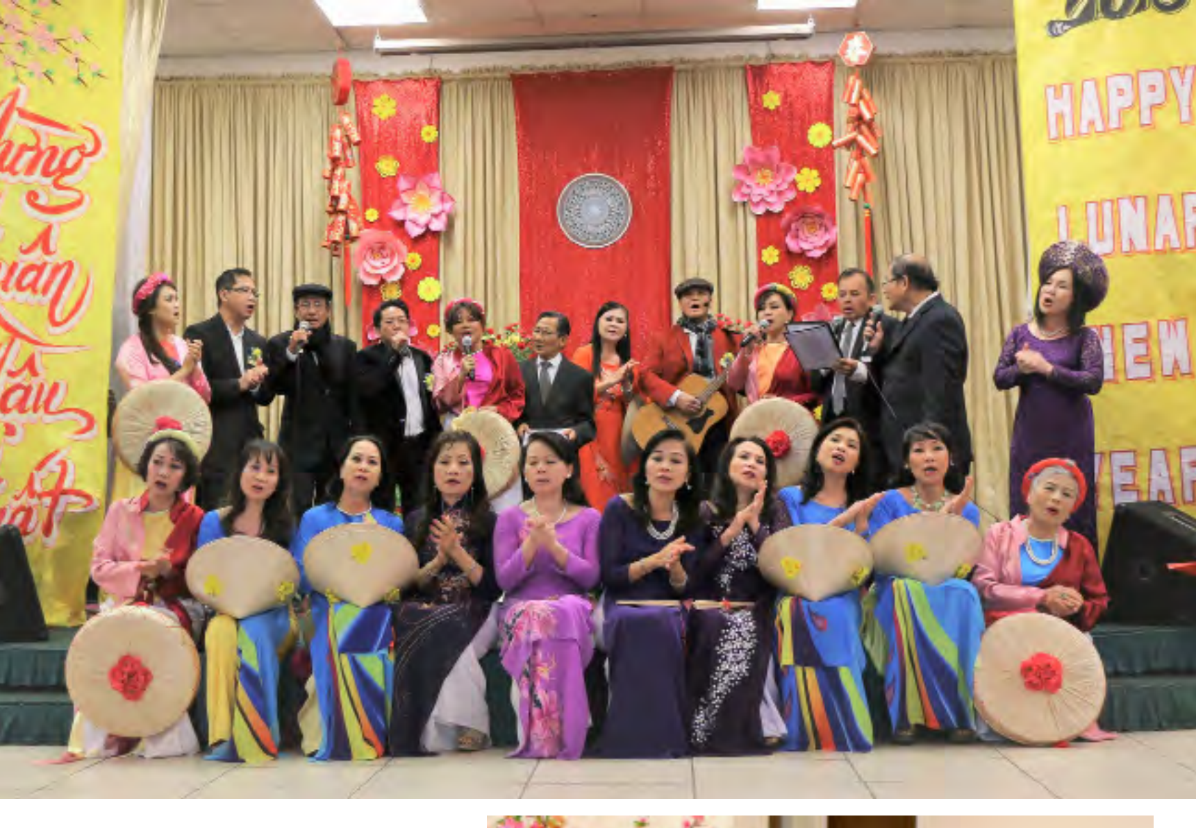
Performing "Ly Ruou Mung" by Zen Tai Chi Group