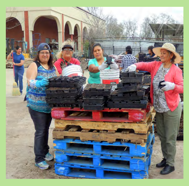
Volunteers prepare soil for seeding.

Community gardens contribute to healthy lifestyles by providing fresh and affordable herbs, fruits and vegetables. Not only do they help to relieve stress and encourage wellness, but they also provide social opportunities to build a sense of community and share a knowledge of gardening, and cooking.