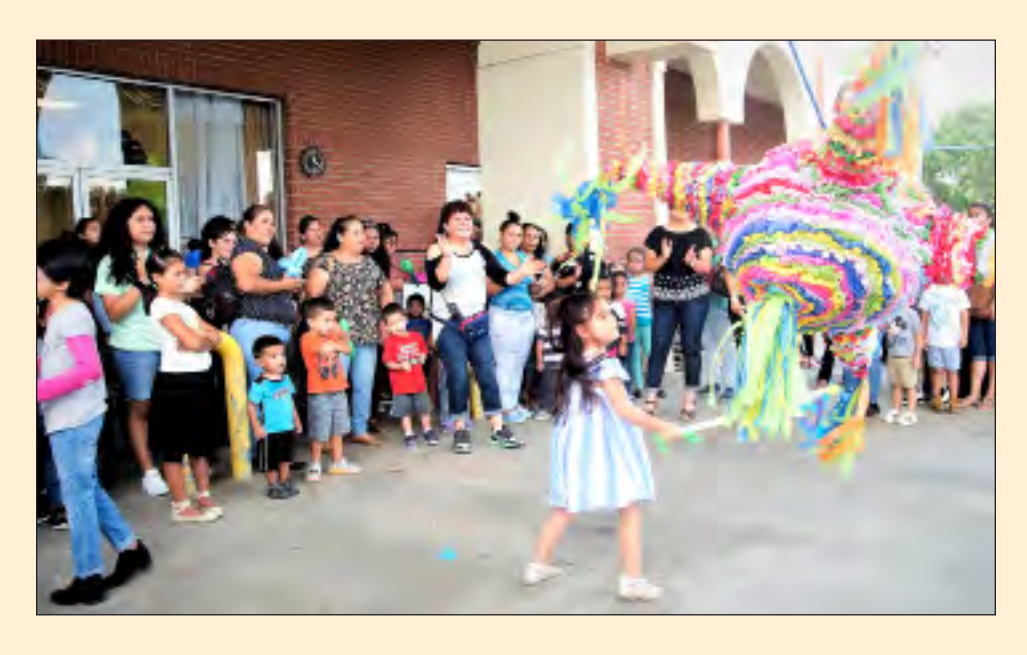
Pinata fun marking the end of Summer session

During the summer of 2018, the Corporation piloted the Kids Cafe Program to support the low-income families who have children living around the Center. The Houston Food Bank sponsored Kids Cafe program collaborates with chefs, dietitians, students, and volunteers. Its mission program is to help alleviate hunger by providing children with nutritious meals during the summer. This is especially helpful for kids who otherwise depend on school lunches for their daily nutrition. Kids Cafe Programs provide free meals and snacks to low-income children.