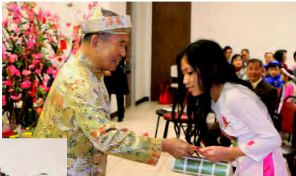
Wishing the elder longetivity