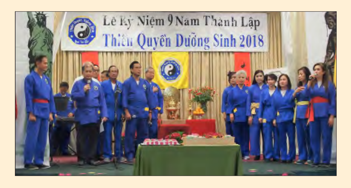
Practicing Zen Tai Chi regularly help these members promote a healthier body and mind.