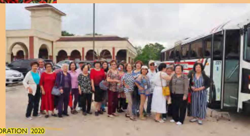
Finalists and sponsors of the annual 2018 Golden Voice Award