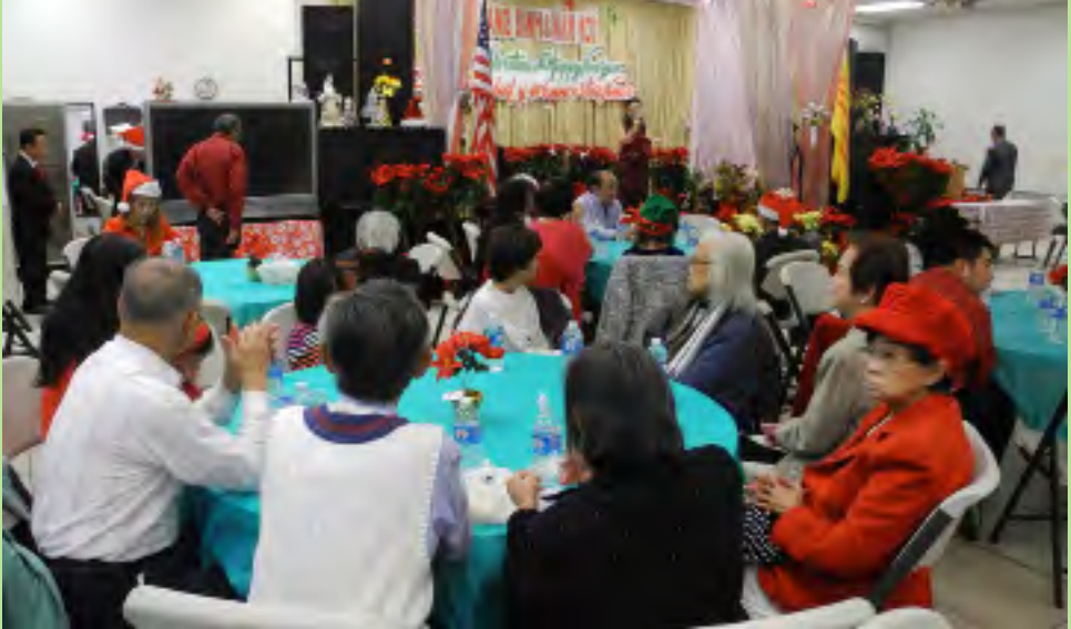
Vietnamese-American Community had its own Christmas Celebration