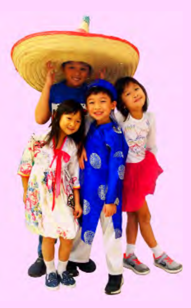
We draw from the same well, stay under the same sun, and enjoy the cultural exchange.